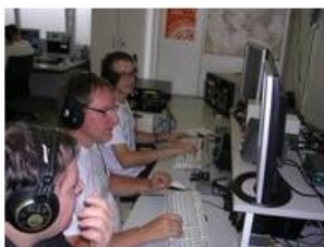
DJ51R, DL2RMC, DL7JAN