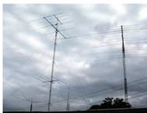
Antennen von DL0MB

DL0MB appears on 12 band/modes. All contacts are made in just 13 minutes, from 16:45 to 16:58. Was it that fast thanks to the online access to all band logs? However it was, this self-contacting is against all kind of ethics in contesting and fair play.