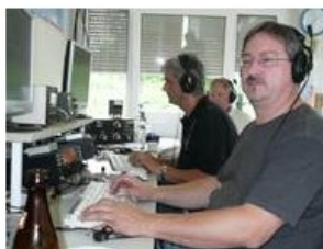
DK6XZ, DK6UZ, DK91P